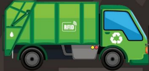
Truck with RFID reader & scale RFID tag, GPS and wireless communication