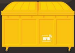
Waste container with RFID Tag

A growing number of cities around the globe are applying technology to waste management solution to create higher efficiency in terms of resources and cost associated with keeping their cities clean.