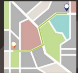
Route analysis for better route planning