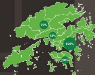
Latest weight of waste on different location pick up points