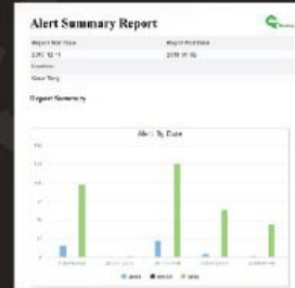
Live monitor the temperature in last 24 hours for all facilities in one dashboard, abnormal alerts and reports