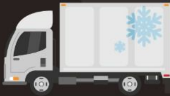
Live tracking & Fleet Management