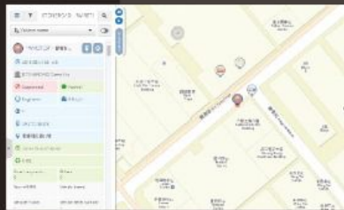
Live tracking cold truck location and temperature reading