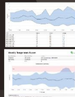
Different reports ready for your analysis