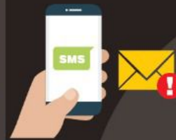
Auto SMS and Email alerts for abnormal readings