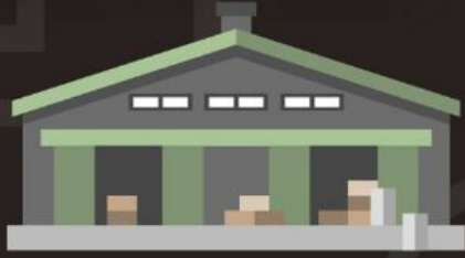
Wireless sensors for Clod Storage

Effective seamlessly monitor the temperature reading of your food process from factory to retail shop to make sure providing the best quality food to the consumer.