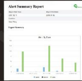
Live monitor the temperature in last 24 hours for all facilities in one dashboard, abnormal alerts and reports